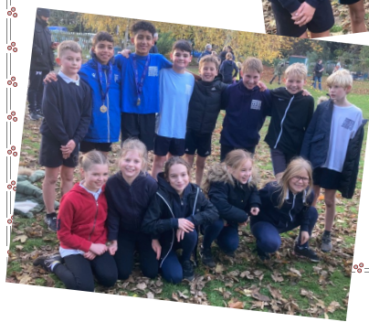
Cross Country Team